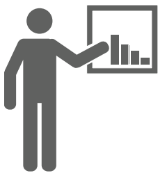
Exhibit 2: Key contract-related actions to prepare for LIBOR transition