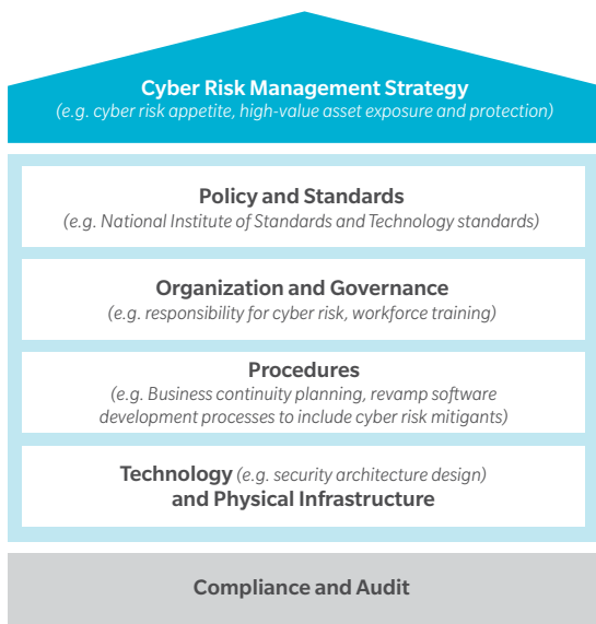
Exhibit 2: An enterprise-wide cyber risk management framework