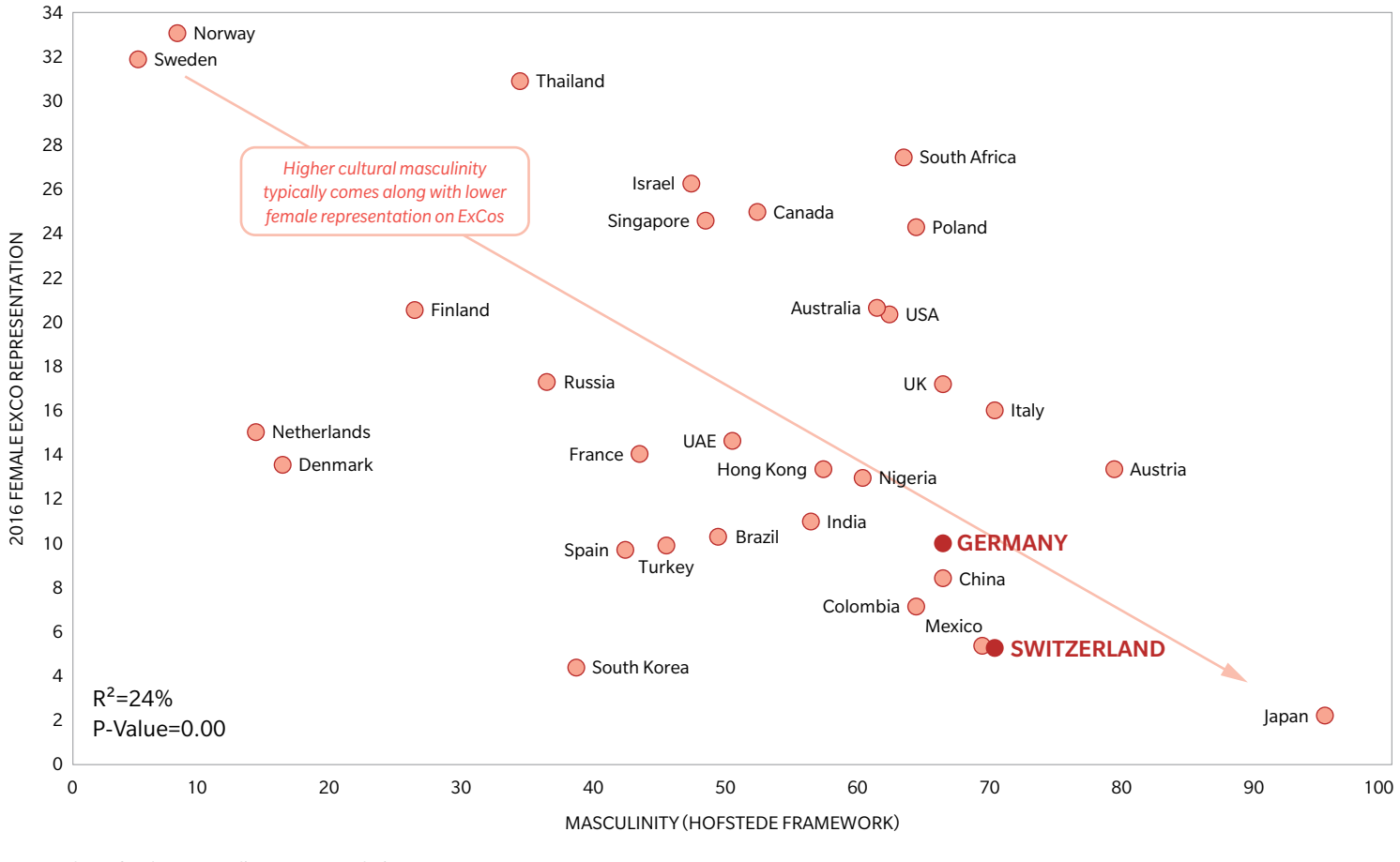
EXHIBIT 3: FEMALE REPRESENTATION ON EXCO 2016 VERSUS MASCULINITY DIMENSION IN HOFSTEDE CULTURAL FRAMEWORK